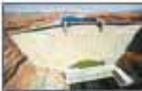
The Canyon Boat and Lake Point